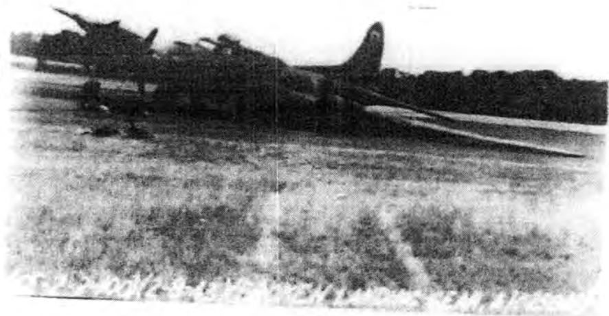
ON 2-24-40 (2-8-43) FORTY LANDING SEAM AIRCRAFT